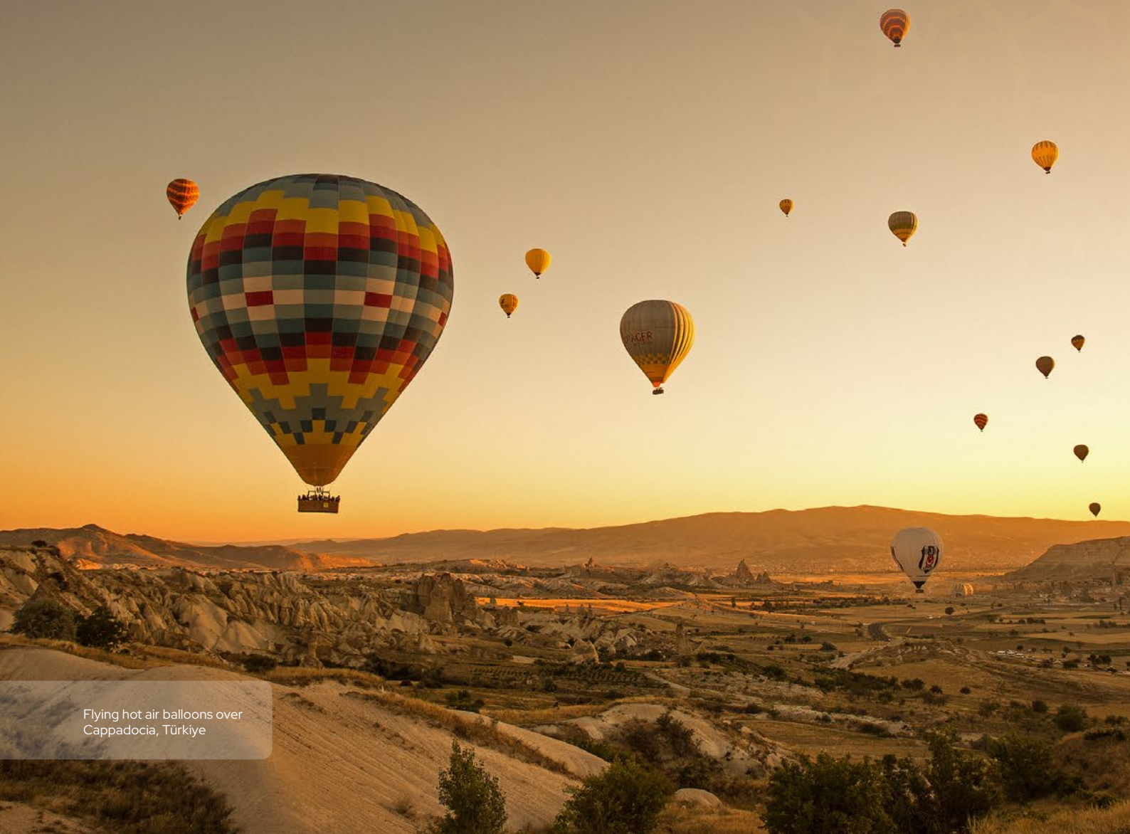
Flying hot air balloons over Cappadocia, Türkiye

Dialogue Events Ltd. United Kingdom +44 (0) 203 790 8883 e-mail: ys@dialogueevents.com