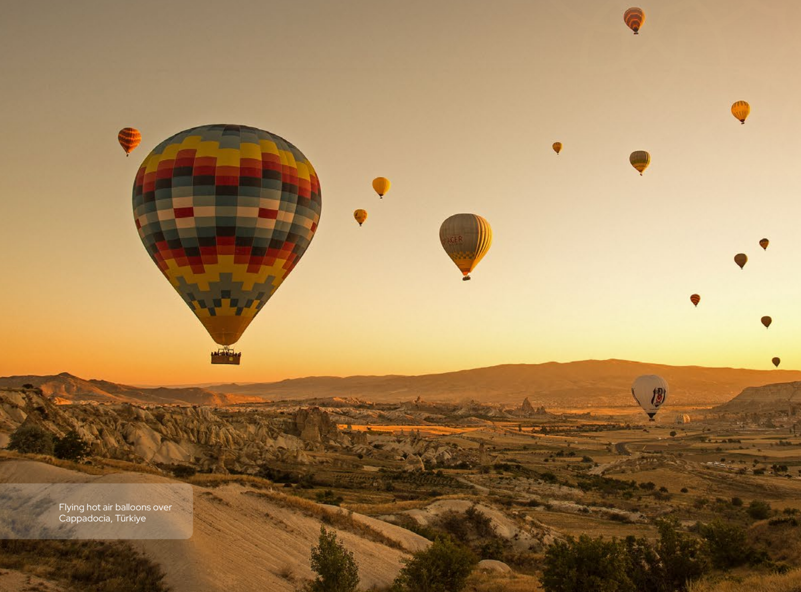
Flying hot air balloons over Cappadocia, Türkiye

Dialogue Events Ltd. United Kingdom +44 (0) 203 790 8883 e-mail: ys@dialogueevents.com